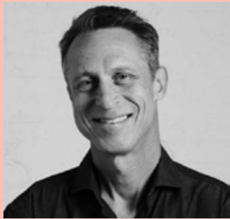
Dr. Mark Hyman Chief Medical Officer

The RoseBar leadership team span a broad spectrum of expertise and experience. Together they represent a progressive force at the vanguard of this new science.